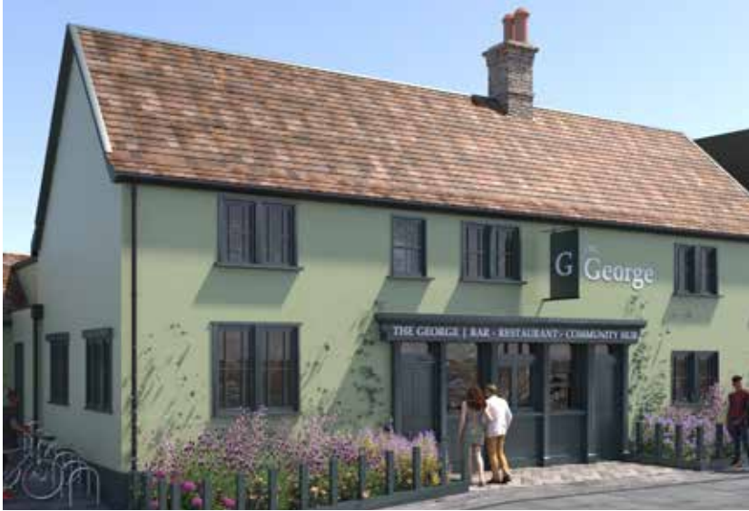
Artist impression – Purcell Architects