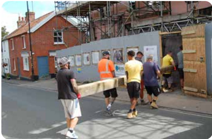
Eight-man team carry massive oak beam.

During that time, we have seen Brexit, Covid, five Prime Ministers and the war in Ukraine; there could never have been a tougher, more, inflationary time to take on the challenge but in May '23 we finally reached our fundraising target thanks to The National Lottery Heritage Fund, The Community Ownership Fund, other grant providers and the incredible support of our shareholders.