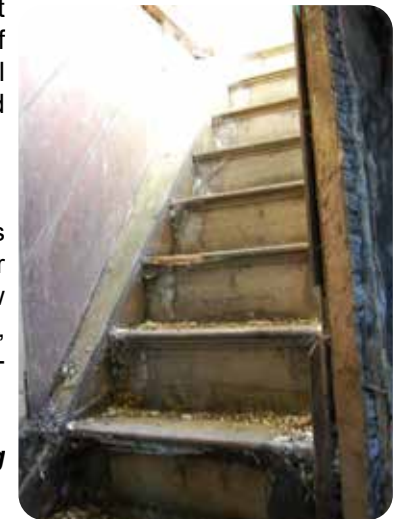
Hidden staircase revealed after fire.